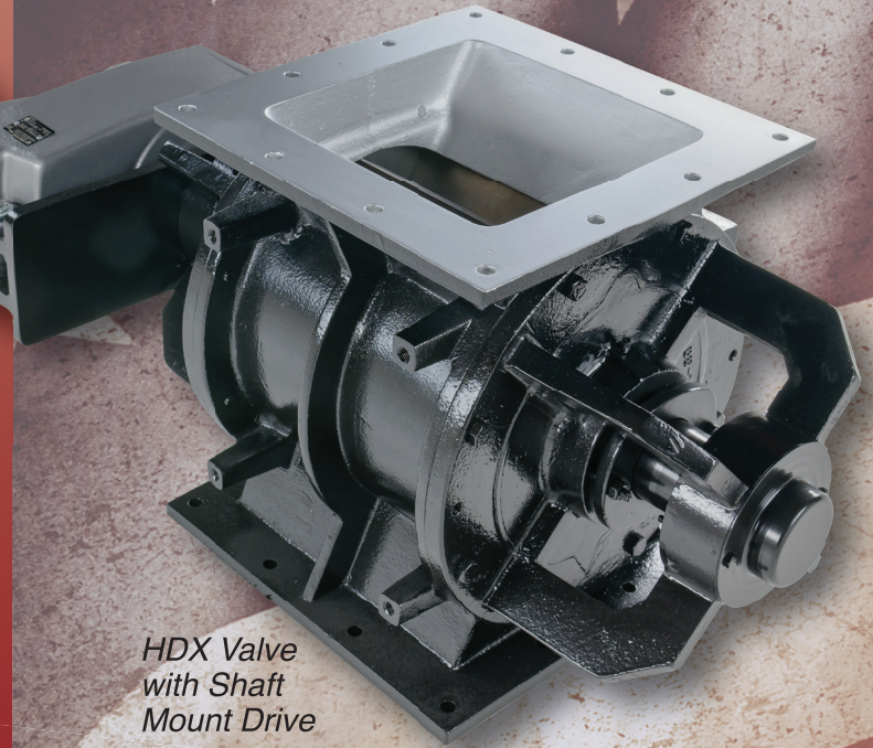
HDX Valve with Shaft Mount Drive